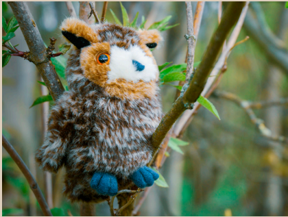
◀ Ollie the owl cuddly toy. Note: Mouse toy may vary from picture shown.

By adopting an owl for £20, you will be helping to continue the conservation work already started, making this an even better place for owls and all the other creatures who make Worsbrough their home. In return you will receive an adoption pack full of information and goodies. To find out more visit www.bmht.org