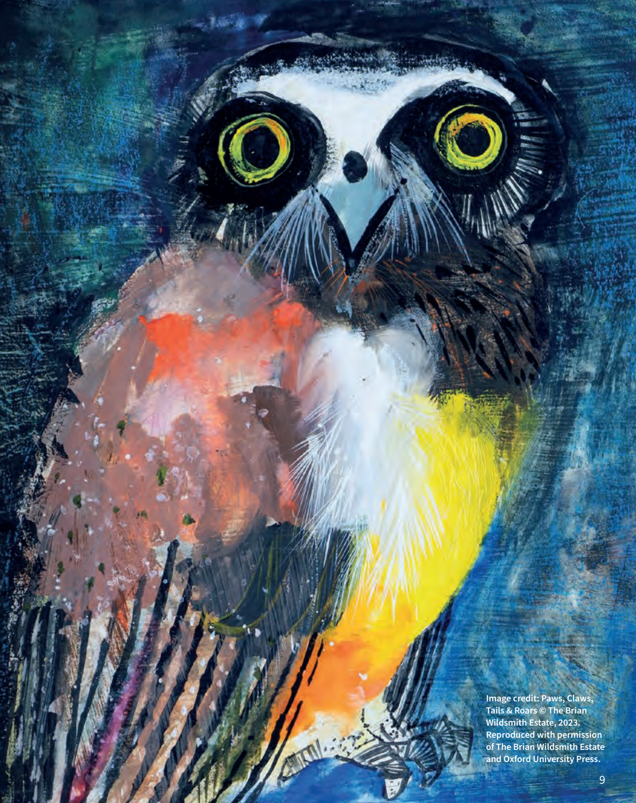
Image credit: Paws, Claws, Tales & Roars © The Brian Wildsmith Estate, 2023. Reproduced with permission of The Brian Wildsmith Estate and Oxford University Press.

For the first time Brian's personal collection of over 40 colourful original illustrations, early works, drawings and paintings will be on display in the beautiful setting of the Cooper Gallery. The walls will be filled with colour and vivid characters. It's a perfect destination for art lovers of all ages and our younger visitors can enjoy our specially created forest activity area 'Brian's Wild Wood', upstairs in the Sadler Room.